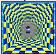
The moving tunnel illusion

A small child could swim through the veins of a blue whale.